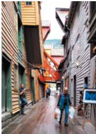
▶ Cool-weather seekers can be found on the streets of Bergen, Norway, where the nearby fjords are a big draw.

"With changing weather patterns and global warming ... Europe is now losing its sheen, as we have seen it hit with heat wave after heat wave and most hotels ill-equipped to handle it," says Panache World's Arun. "I see a new trend and travel patterns changing, and more people opting for the Southern Hemisphere during the summer." N