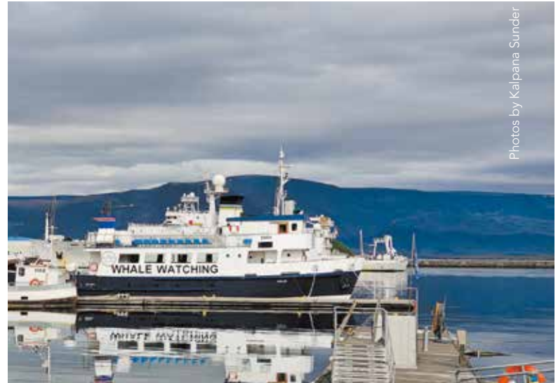
▲ A whale-watching boat in Iceland: Other popular water-centric activities include wild swimming and cold-water plunges.

Apoorva Mohan, 30, a recruitment professional in Singapore, says she chooses vacation destinations such as Australia, Hong Kong and Europe where her family can experience different seasons. "This year we are planning to go to Norway to experience autumn, where it will be hopefully comfortable to do some hiking, outdoor activities. We are planning a trip to Japan in the winter."