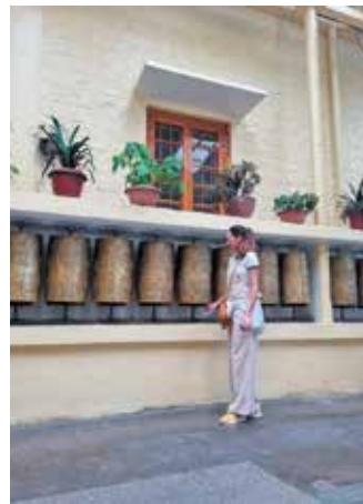
▶ Valek takes a break from the heat in the northern Indian city of Dharamshala.