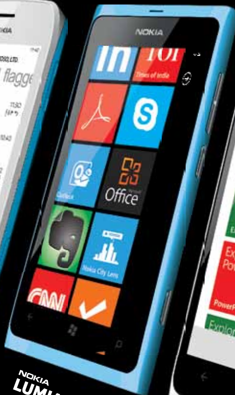
NOKIA LUMIA 800