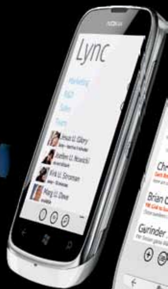
NOKIA LUMIA 610

E-Mails, Messages & News feeds constantly updating on your start screen.