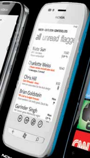
NOKIA LUMIA 710