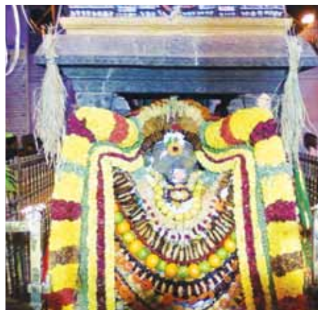
Clockwise from above: A vegetarian thali served at one of the many restaurants in Chennai; Bird's eye view of Chennai city; Kapeeshwar Temple in Mylapore

the London Courts. There is a grand central cupola – once the first lighthouse of Chennai on the premises, exquisite stained glass and intricate windows shaped like jharokas . Follow it with a 'Steeple chase' walk through the atmospheric churches of Chennai ranging from the historic St Mary's Church inside the Fort St George (where Robert Clive got married) to