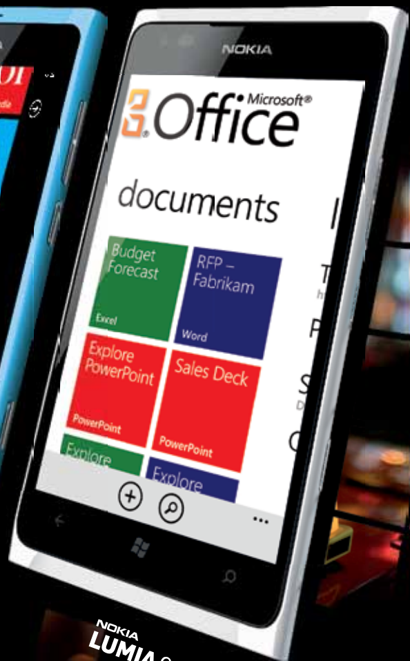
NOKIA LUMIA 900