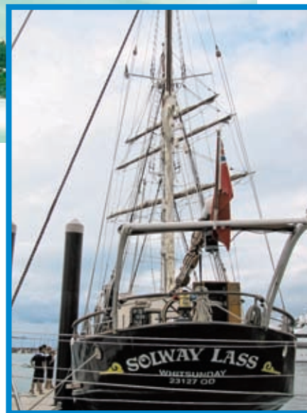
(Above) An aerial view of the Whitsunday Islands; (inset) The restored Solway Lass , a 100-year-old sailing boat

and lorikeets greet me from the railings of the balcony.