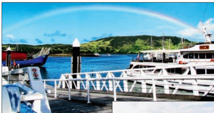
(Above) A view of the Marina on Hamilton Island; (right) The sprawling golf course on Dent Island

WAYFARER ▶ The picturesque Whitsunday Islands, off the coast of Australia, are the perfect getaway for the city-weary soul, says Kalpna Sunder