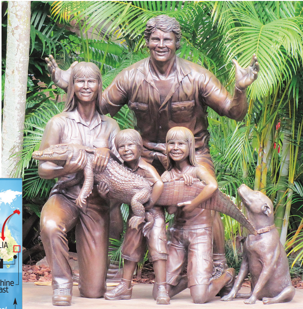
Statues of television personality Steve Irwin and family outside the Australia Zoo in Sunshine Coast. Irwin died of a sting ray barb while filming a documentary.

I N THE background is Mount Coolool, the third largest monolith in Australia with an almost flat summit. The first Europeans in Coolool were shipwrecked sailors. Today, Coolool is home to the famous Kite festival.