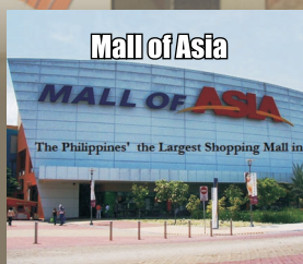
Mall of Asia