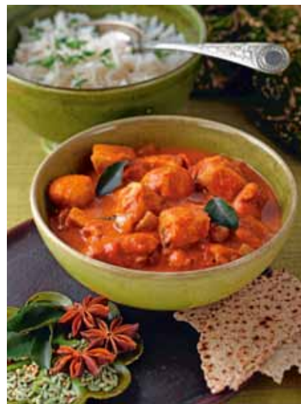
Chettinad chicken has a thick gravy that is slow cooked with coconut and cashew nuts.

residence of the British Collector, now a restored boutique hotel with high ceilings and vintage furniture. On the beachfront at the southern end of the village is the ancient Masilamani Nathar Temple built in 1305. Ravaged by the battering sea, it was already fighting a losing battle, when the 2004 tsunami damaged it further. Finish the walk at the barren Danish Cemetery with its whitewashed graves on Kavalamettu Street (parallel to King Street).