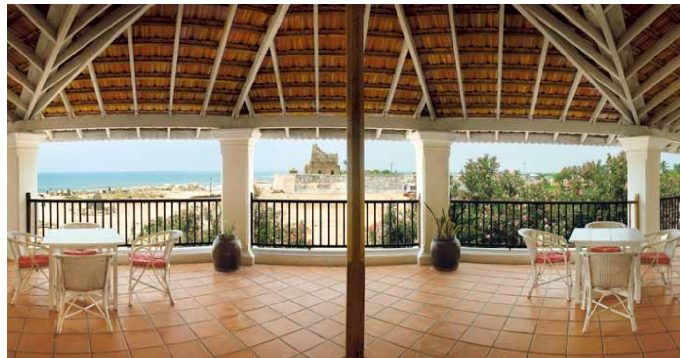
Bungalow on the Beach is a shore front colonial bungalow that is now a hotel.