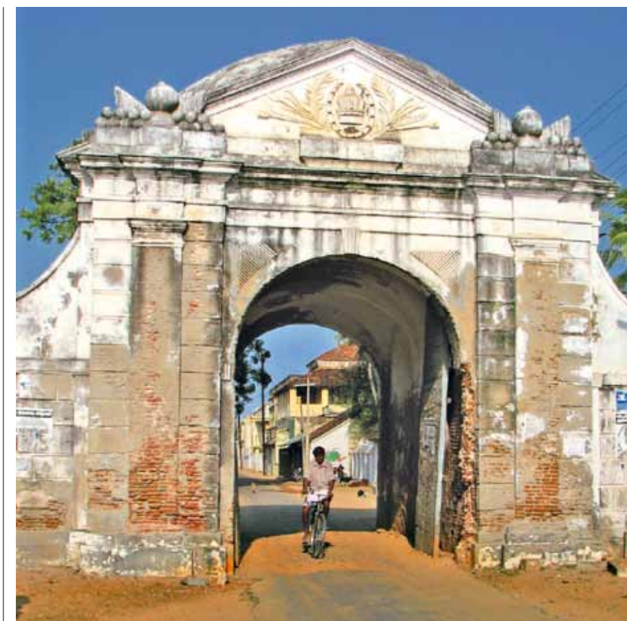
A monument in memory of Ziegenbalg and Plütschau (left), the first Protestant missionaries to India; The town gate (above) welcomes visitors with a Danish emblem.