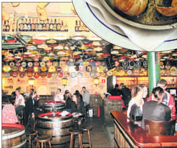
Delirium Cafe with beers from all around the world!

Mussels is the most iconic dish here and is served in large pots, with a broth made from white wine or beer. The Belgians claim that they invented the 'French fries' and here they are called Frites.