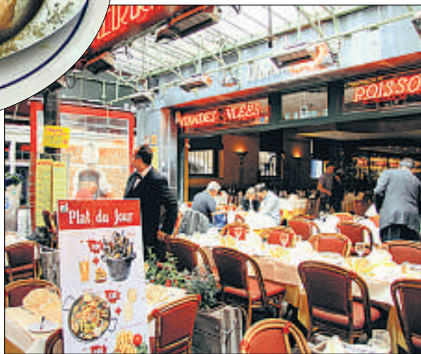
Food Street- Rue de Bouchers